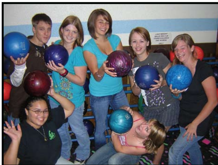
GladYAC Volunteer Youth enjoy an afternoon of team-building.